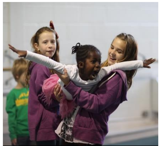
Children's Theatre participants

But at Chickenshed, these perceived barriers don't matter. Our members see for themselves the value that each individual can bring . They grow to understand that the high quality of the work we create is not despite including everyone, but because we include everyone. All these values are then taken by our members in to their homes, their schools, their communities, and their futures, contributing towards our aim of creating a more inclusive world for us all.